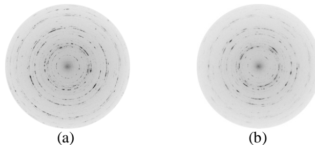
Figure 1. 2D diffraction patterns of a Ti-Al-Nb alloy at (a) room temperature and (b) T = 680^{\circ}\text{C}

Hot Isostatic Pressing (HIPping) is a densification technique widely used in the metallurgical industry, for example, to remove the internal porosity generated during casting. In recent work [8] it has been found that the pressures used during such a process can alter the equilibrium proportion and thus the properties of phases in a Ti-Al-Nb alloy. Precise measurements of the lattice parameters of the various phases present at room temperature and at the HIPping temperature were performed on beamline ID15B of the ESRF using an induction furnace and a 2D detector to calculate the corresponding variation in atomic volume and thus determine the change in volume fraction. Furthermore, the 2D image and integrated diffraction pattern contain more information than traditional powder patterns by enabling the rapid viewing of a large solid angle of detection within a single collection frame as shown in figure 1.